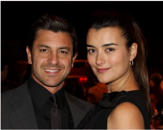
Diego Serrano and Coté de Pablo