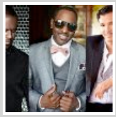
The WAVE's Winter Wonderland Featuring Brian McKnight, El De Barge, and Johnny Gill (94.7 The WAVE)