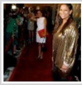
Debbie Allen Dance Academy Presenting Free Concert With Complexions Contemporary Ballet (94.7 The WAVE)