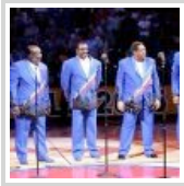
Broadway Musical In Process For The Temptations (WBAV - 101.9)