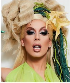
Queen Gynecia ALASKA 5000 ( RuPaul's Drag Race )