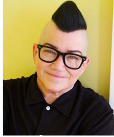
King Basilius LEA DELARIA ( Orange is the New Black )